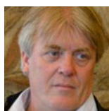
Gustavo Vera MP City of Buenos Aires, Argentina