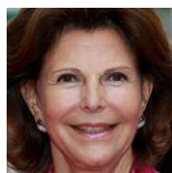
H.M. Queen Silvia of Sweden Co-founder of the World Childhood Foundation Honorary board member of The Mentor Foundation International