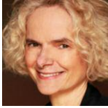
Dr. Nora Volkow Director of the National Institute on Drug Abuse (NIDA) at the National Institutes of Health, Bethesda, Maryland, USA