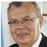
Yuri Fedotov Executive Director of the United Nations Office on Drugs and Crime (UNODC), Vienna, Austria