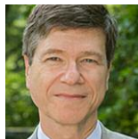
Prof. Jeffrey Sachs Director of The Earth Institute, Quetelet Professor of Sustainable Development, and Professor of Health Policy and Management at Columbia University, New York, USA